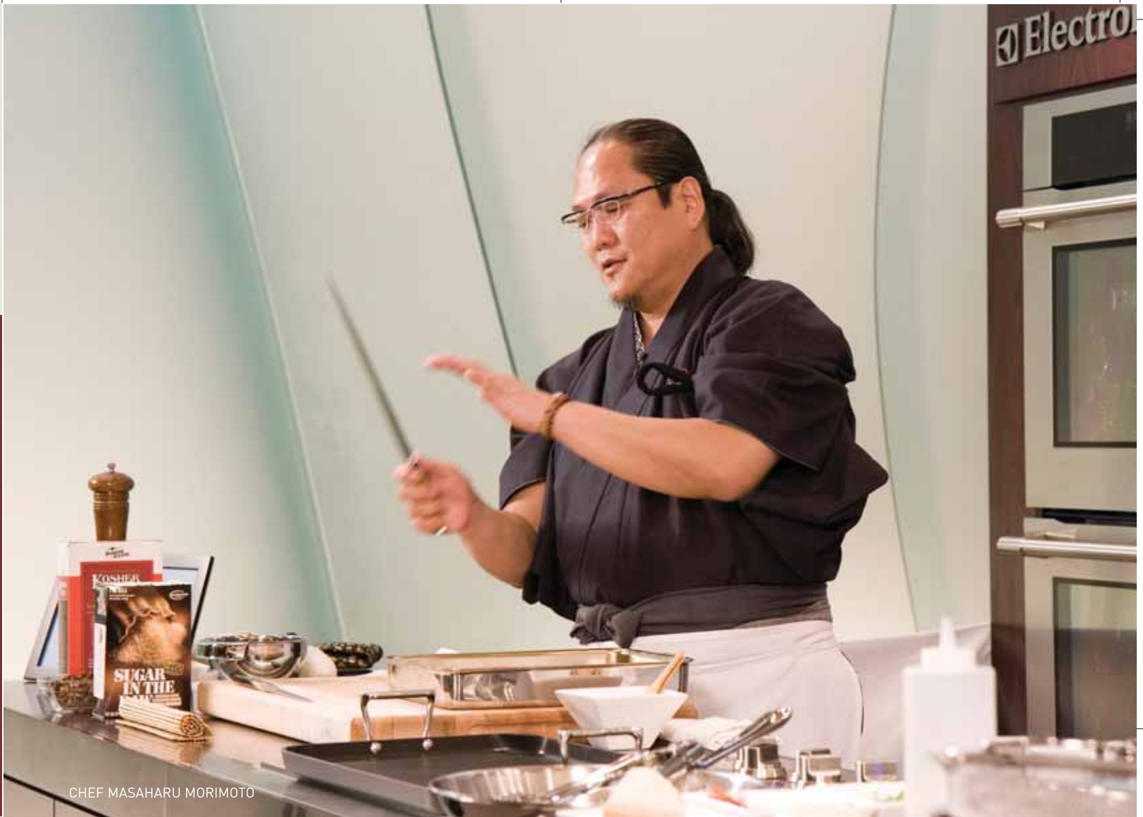
CHEF MASAHARU MORIMOTO