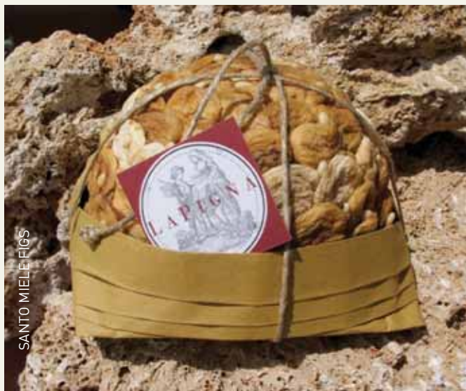
basket of figs stuffed with nuts and wild fennel; Cilento Figs stuffed with almonds wrapped in fig leaves; "Salami Log" of figs with their peels; Sweet Capicollo: figs with dark chocolate and almonds; Arabic Capicollo:

figs with pistachios, cinnamon, almonds; Scugnizzi – Figs covered with cinnamon, brown sugar, and cocoa. www.bonvoyagegourmet.com .